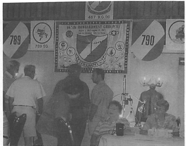
Several enjoying conversation in the Hospitality Room.