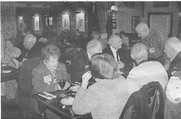
LUNCH AT THE GREEN MAN