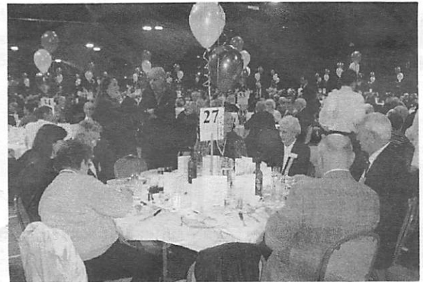
DINNER AT THE 2AD BANQUET