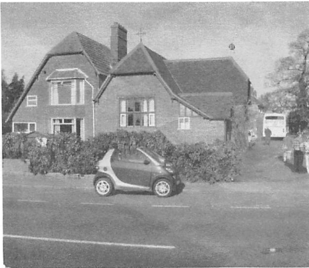
BARSHAM AND SHIPMEADOW CHURCH