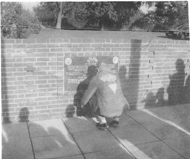
JAY SHOWER LAYING A REEF AT THE REID MEMORIAL

The above photos were taken at Barsham. The photographs following were taken during Base Day and include only a few of the ones that will be placed on the Web Page as a part of our convention display we intend to put on the web. Once they are on the Internet, if you have additional pictures, please let us know, send them to us and we will scan them and return to you as soon as possible.