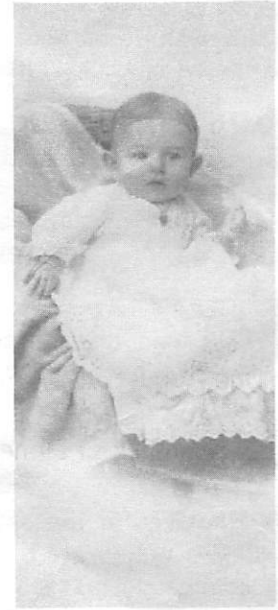
CAN YOU GUESS WHO THIS IS A PICTURE OF?