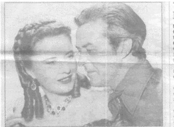
STAR TURN: Barbara Stanwick - here with Ray Milland in the western California - had a screen premiere with My Reputation at Rackheath's USAAF base.

A little trip down memory lane for those who might have set in on the premier showing.