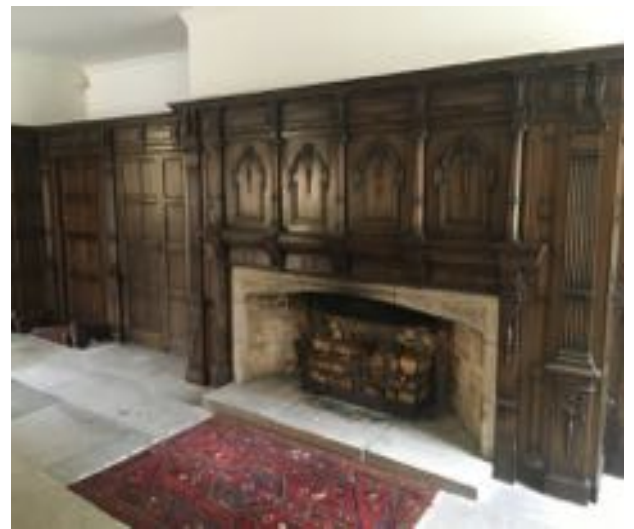
A glimpse inside the entrance of Rackheath Hall