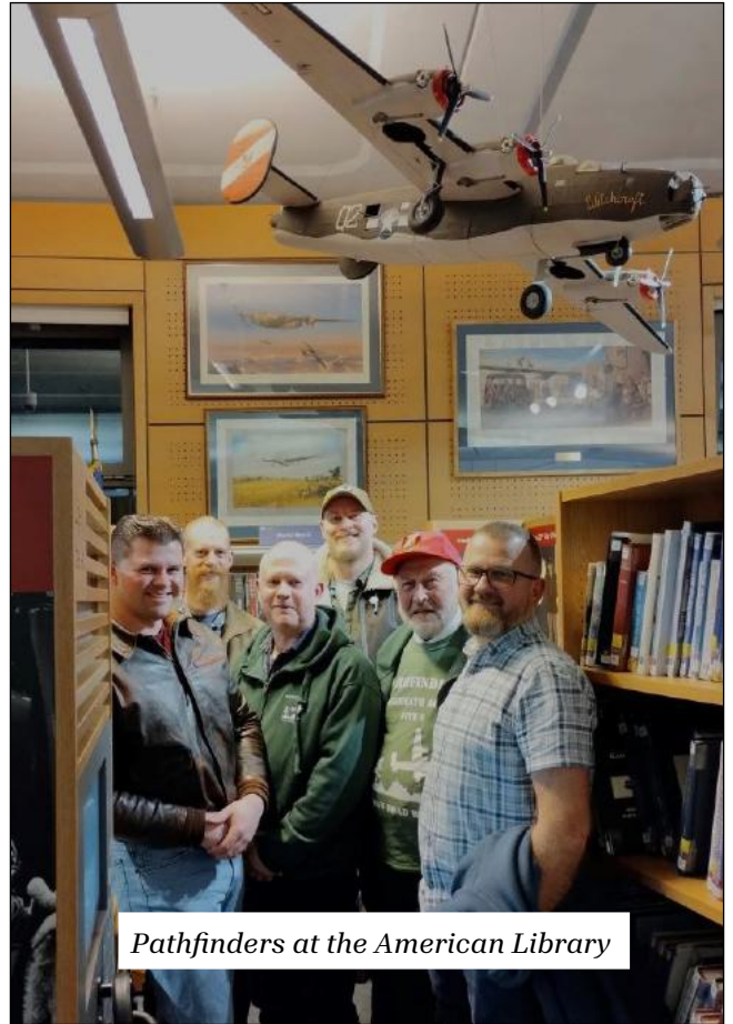
Pathfinders at the American Library

More recently we have acquired a high definition aerial photograph depicting Site#6 taken in July 1945. The degree of detail is stunning revealing the presence of several vehicles, one of which is a jeep. This photograph has been of enormous assistance in positively identifying detailed features of the buildings and their surroundings. This includes a previously unknown cinder-path running from Col. Shower's quarters to Newman Road which has since been "uncovered" beneath layers of soil and vegetation.