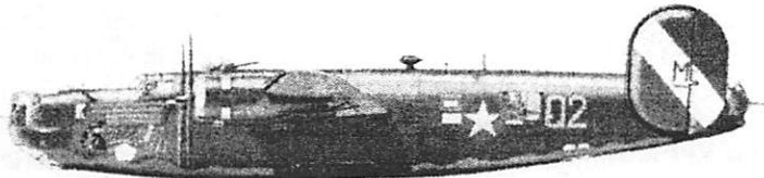
Ray Betcher Aircraft Mechanic - Witchcraft 467th BG (H) - 790th Squadron

Personalized polo shirts with any combination of the design elements above are being offered by Kevin Coolidge (son of Myles Coolidge, co-pilot, 791st Sqdn.). The artwork on the white shirt is in color, printed above the pocket: natural metal finish or olive drab finish B24, squadron markings for your squadron (X7-788th, 6A-789th, Q2-790th or 4Z-791st). The polo shirts are priced at $25. The shirts can be further personalized by the addition of a crew photo on the shirt back for an additional $10. Kevin will accept orders and will deliver the shirt to you at the 97 Convention. If you cannot attend, he will mail your shirt to you for an additional $3 for Priority Mail. These polo shirts were well received at the reunion in Savannah. In addition, Kevin also makes caps in the 467th livery using the aircraft artwork above, including 8th AF, 2nd Air Division affiliation. The cap is offered at $10. Write to Kevin Collidge at 760 La Loma Lane, Corona, CA 91719. Call or Fax at 902-278-0204.